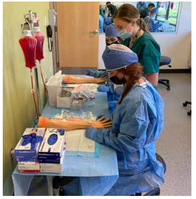
Students at the Dublin campus assist with the Medical Academy, a summer program for local high schoolers interested in health careers.